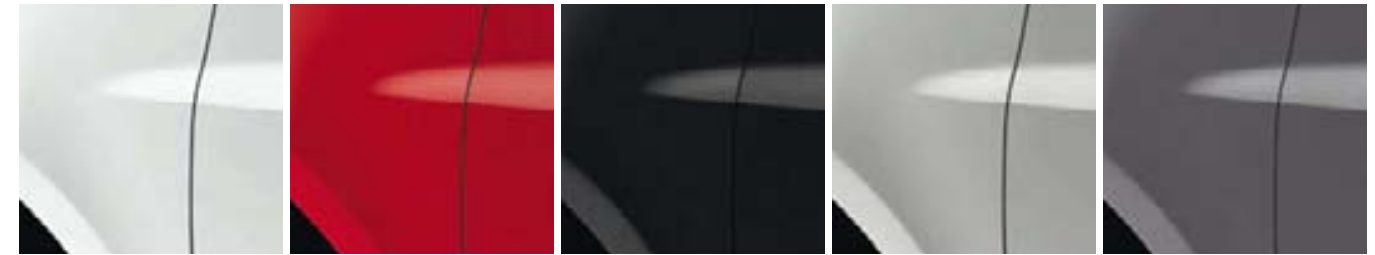
GLACIER WHITE (NM 369) CAPSICUM RED (NM 727) PEARL BLACK (MP 676) MERCURY (MI D69) OYSTER GREY (MI KNG)